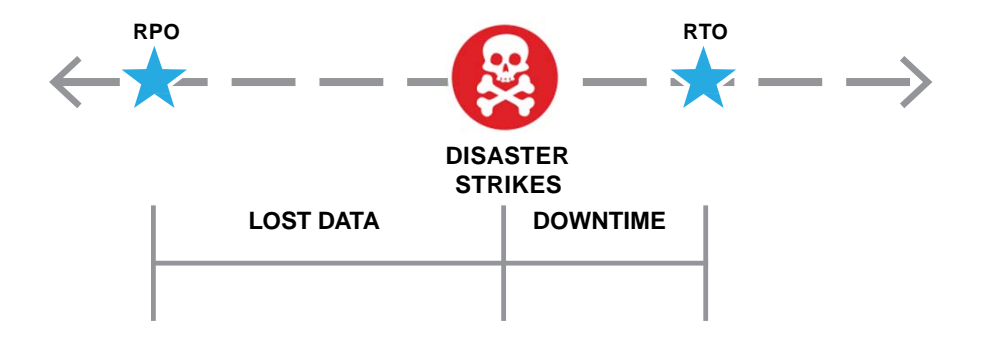
Figure 6: The difference between RPO and RTO

By calculating your desired RTO, you have determined the maximum time that you can be without your data before your business gets into serious trouble. Alternatively, by specifying the RPO, you know how often you need to perform backups, because you know how much data you can afford to lose without damaging your business. You may have an RTO of a day, and an RPO of an hour. Or your RTO might be measured in hours and your RPO in minutes. It's all up to you and what your business requires. But calculating these numbers will help you understand what type of data backup solution you need (See Figure 6).